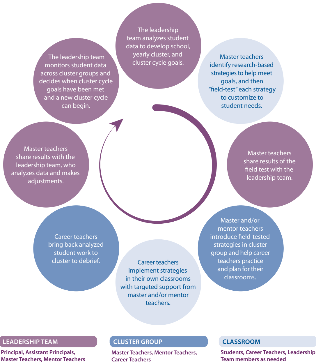
FIGURE 2. OVERVIEW OF PD IN TAP SYSTEM SCHOOLS